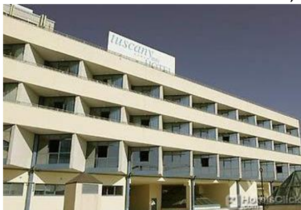
Hotel Tuscany Inn

Via Cividale 86, 51016 Montecatini Terme